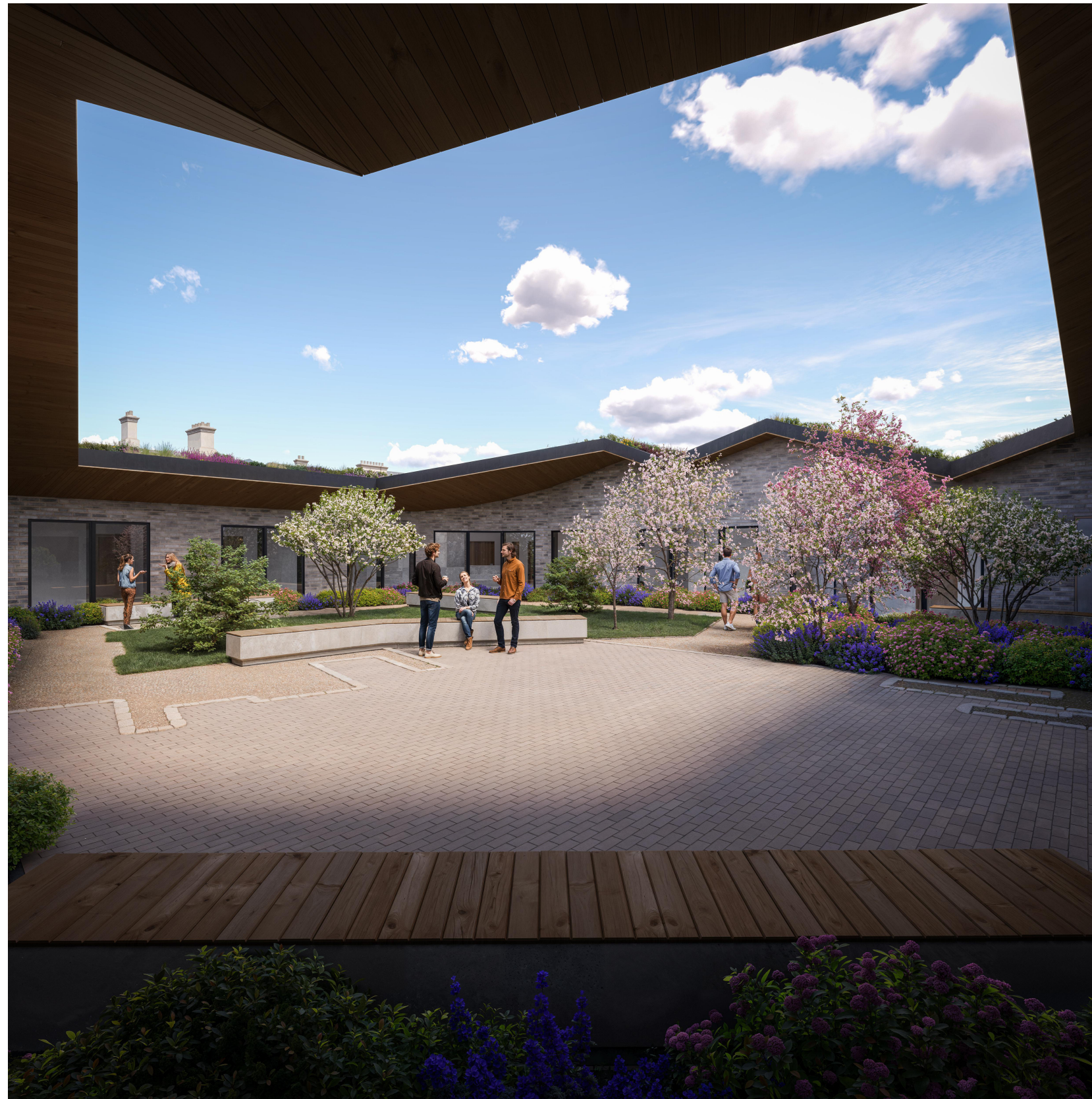
14-Bed Adolescent In-Patient Unit Internal Courtyard

COPYRIGHT: The design and details shown on this drawing are applicable to The Named Project only and may not be; reproduced, modified or relayed in whole or part or be used for any other project or purpose without the prior written permission of TOT Architects with whom copyright resides. DO NOT SCALE this drawing. Use figured dimensions only. The Contractor is responsible for checking all levels and dimensions on site prior to commencement of works. Any discrepancies are to be referred to the ARCHITECT. Drawings to be read in conjunction with all other Consultants Drawings & Specifications were relevant. Proprietary items shall be fixed in strict accordance with the Manufacturer's Instructions. Sizes of proprietary items shall be checked with Manufacturer.